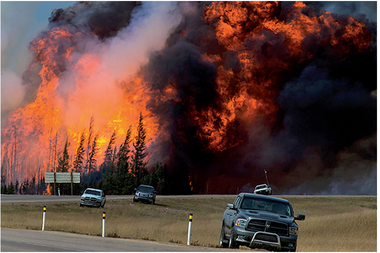
Flames tower above the treeline next to Highway 63 south of Fort McMurray, Alberta, Canada, on May 7, 2016.

Fires, whether naturally occurring or manmade, have substantial impacts upon society. Wildfires can destroy vast tracts of land, releasing tons of aerosols and gases into the atmosphere, while destroying homes, wildlife habitats, and valuable resources. Recording and monitoring fires from ground-based observations is a labor intensive and expensive process that results in an incomplete record. Satellites allow for detecting and monitoring a range of fires, providing information about the location, duration, size, temperature, and power output of those fires that would otherwise be unavailable. With the GOES-R Series, this information can be used to track fires in real time, provide input data for air