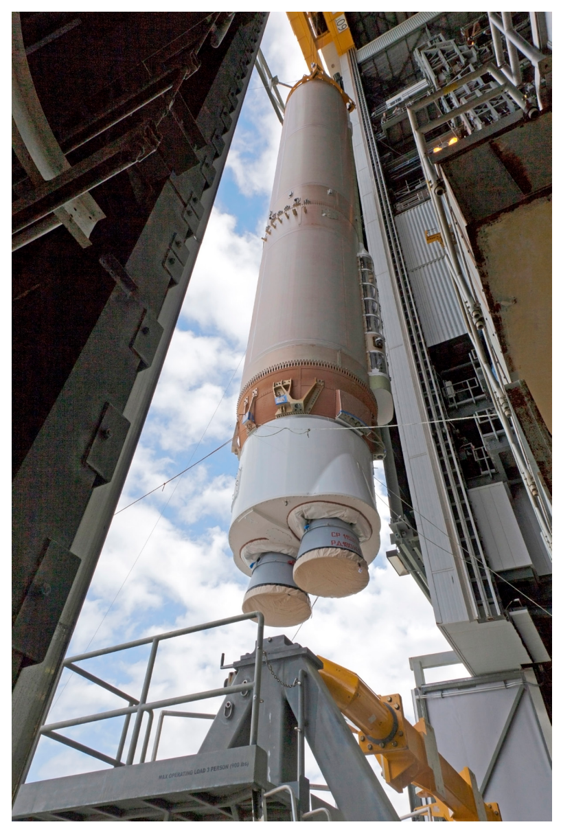
GOES-S Atlas V first stage booster lifted to vertical on stand.

The Atlas V first stage for GOES-S was lifted onto the stand inside the Vertical Integration Facility at Space Launch Complex 41 on January 31. The first stage of the rocket holds the fuel and oxygen tanks that feed the engine for ascent and powers the spacecraft into geostationary orbit.