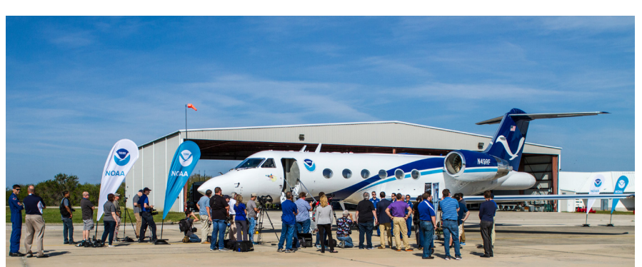
Media gathered around the NOAA G-IV aircraft during the open house held on March 1.

(G-IV) aircraft at Kennedy Space Center's Shuttle Landing Facility. There, they learned about its specialized instruments and interviewed NOAA experts who conduct research or use data from this aircraft and the GOES satellite system. The G-IV is a high-tech aircraft piloted by NOAA Corps officers and crewed by NOAA civilian engineers and meteorologists and used for hurricane forecasting and research.