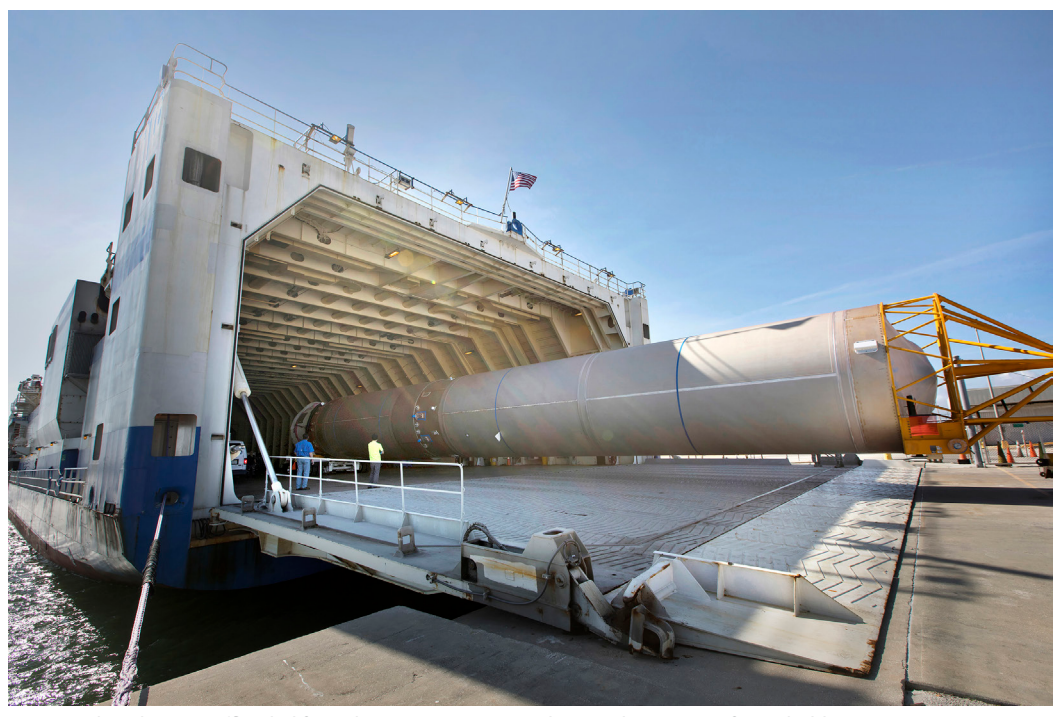
GOES-S Atlas V booster offloaded from the Mariner transport ship.

The United Launch Alliance Atlas V booster and Centaur stage for GOES-S arrived in Florida on January 22. A Mariner transport ship delivered the components to the Army Wharf at Cape Canaveral Air Force Station. The Atlas V booster was moved to the Atlas Spaceflight Operations Center near Space Launch Complex 41 and the Centaur was taken to the Delta Operations Center.