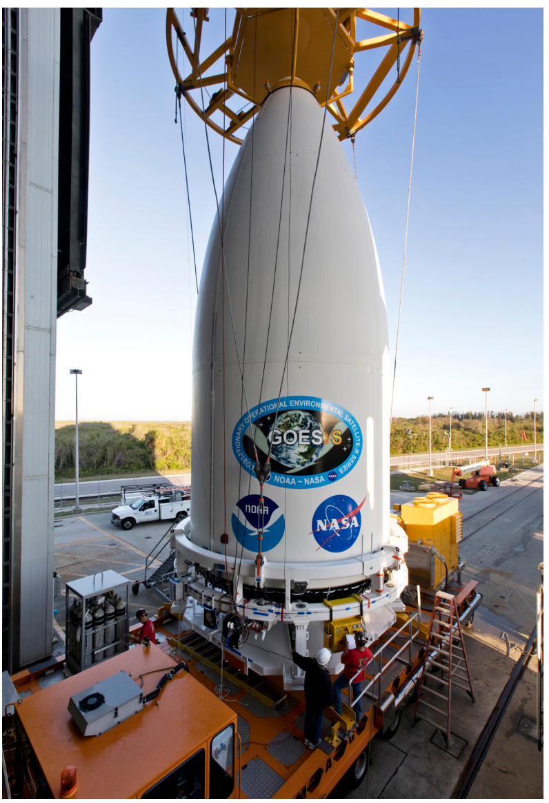
The payload fairing containing GOES-S is lifted by crane for mating to the Atlas V rocket.

The GOES-S satellite media tour was held February 23 at NASA Goddard Space Flight Center. This event allowed broadcast meteorologists to conduct short interviews via satellite with subject matter experts from NOAA and the GOES-R Series Program. Nearly 50 media outlets from across the United States participated.